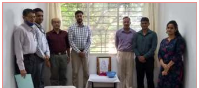
Maharishi Valmiki Jayanti 2021 | 22th October 2022