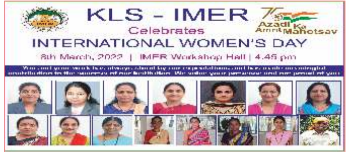
International Women's Day | 08th March 2022