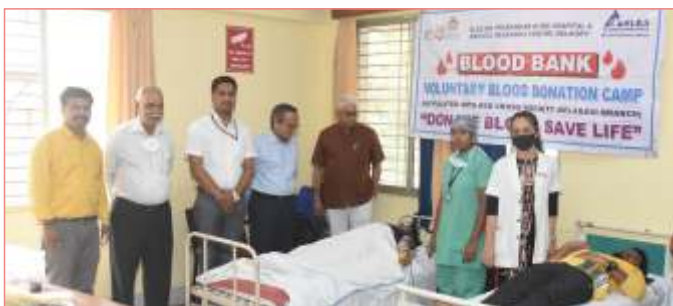
Blood Donation Camp | 26th March 2021