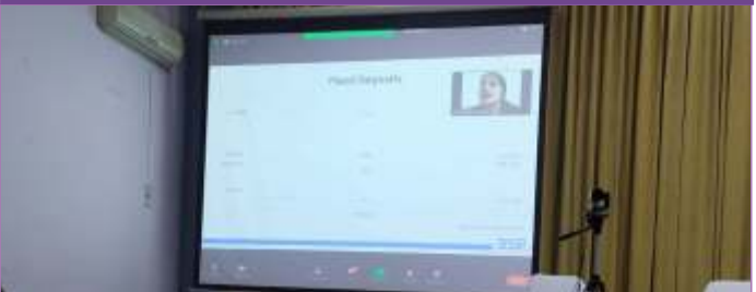
Virtual investor awareness program for students, conducted by United Training Services India (UTSI) on behalf of BSE on 25th August, 2021.

Investor Awareness Program | 25th August, 2021