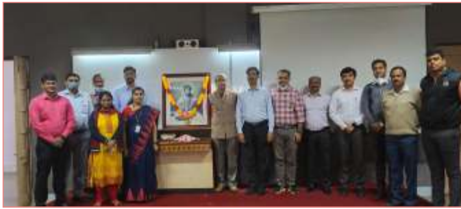
Swami Vivekananda Jayanti | 12th January 2022