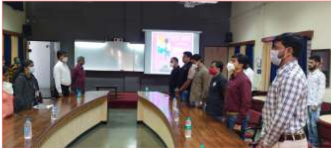
Observation of Martyrs Day | 30th January 2022