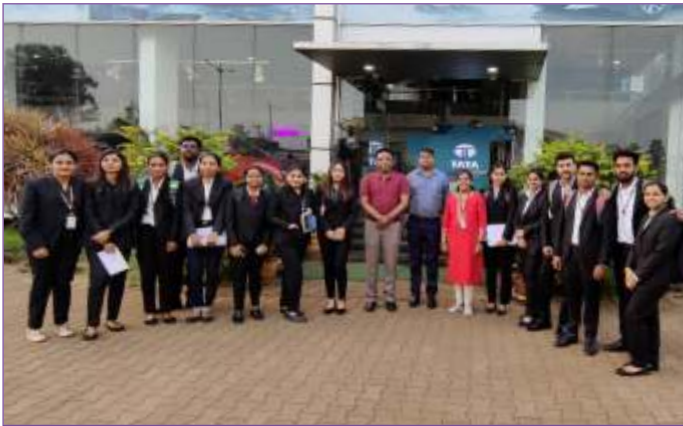
Manickbag Automobiles Private Limited, Belagavi. | 15th December, 2021