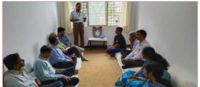
Dr. B.R. Ambedkar Jayanti Celebration | 14th April 2022