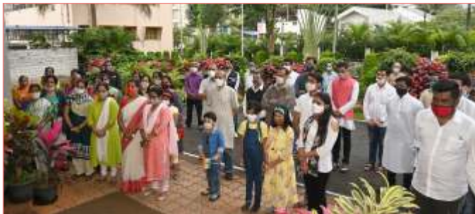
Independence Day | 15th August 2021