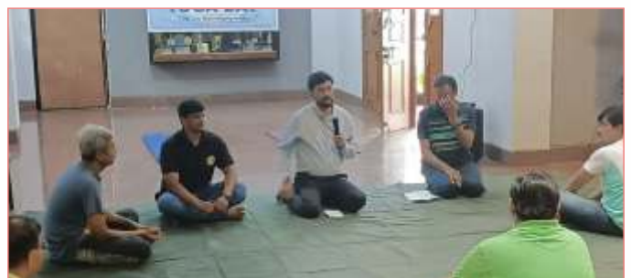
International Yoga Day | 21st June 2022