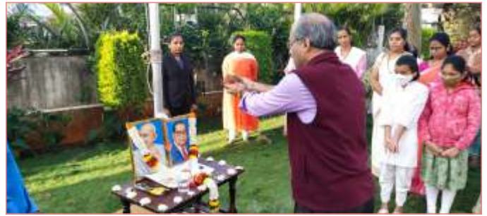
73 rd Republic Day Celebration | 26th January 2022