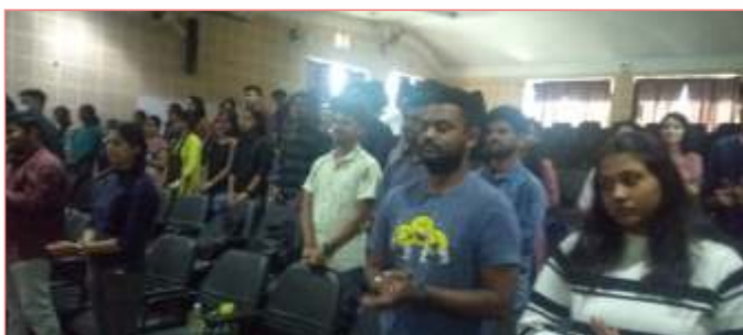
Karnataka Rajyotsava Day | 28th October 2021