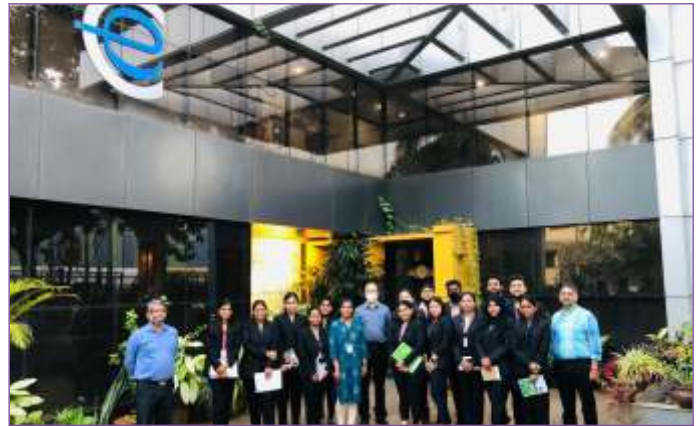
Expert Valve & Equipment Private Limited, Belagavi. | 17th September, 2021